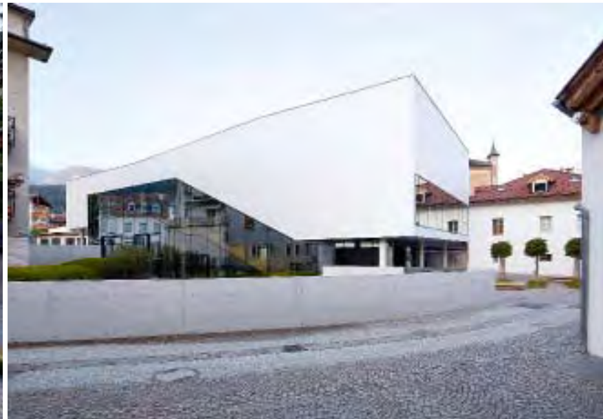
The slight slope of the plot affected the facade design: the height offset is made clear by the slant of the post and beam construction.