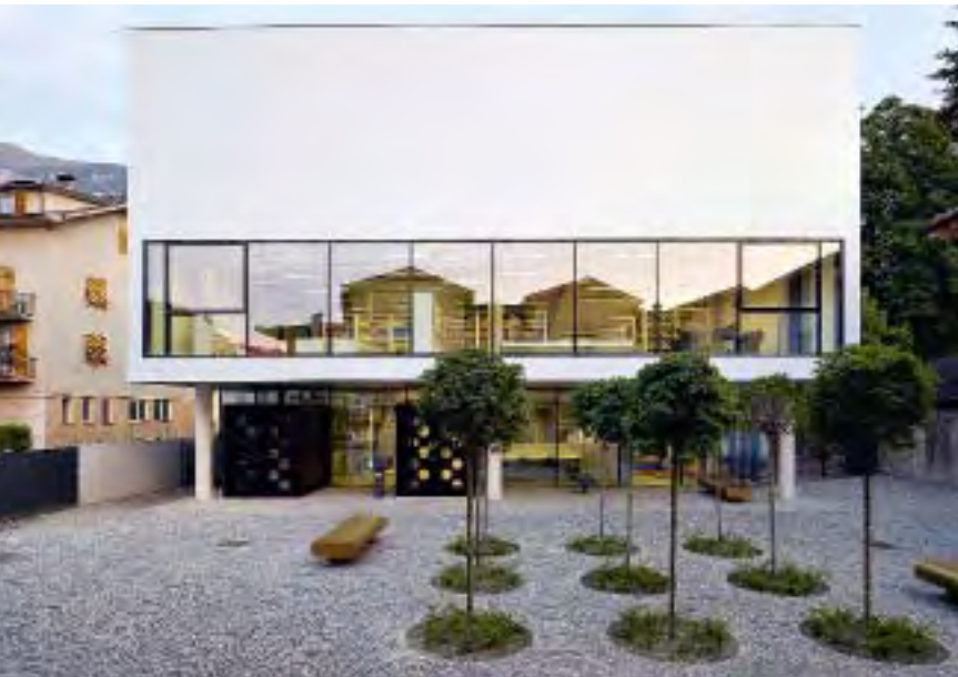
A new square was created in front of one of the entrances. Its shady garden and benches make it ideal for whiling away the day.